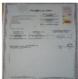
Open License Sheet