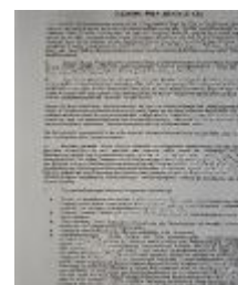
Open License Contract